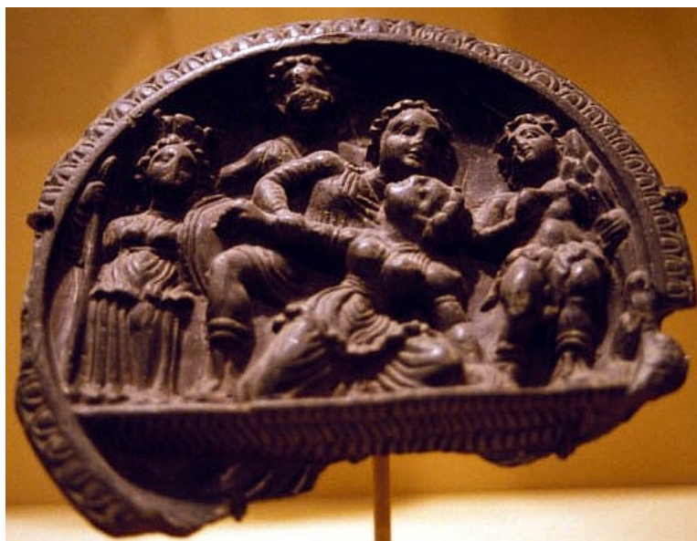
Gandhāran Palette ( Tabula Iliaca) with Achilles and Penthesilea. Metropolitan Museum of Art, New York.