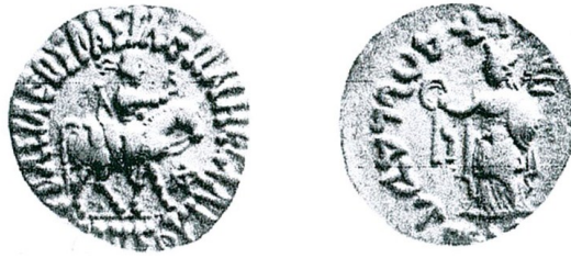
Azilises coin with “pantheistic” goddess (from Whitehead 1914: pl. XIII.336)