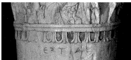
Inscription on Nisa Rhyton 76 (detail from Bernard 1991: pl. XVI)

Another inscription regarding the cult of Hestia comes from a “less sacred” context of the royal palace of Parthian Nisa. The inscription in this case is a simple label with just the name of the goddess, incised on one of the ivory rhytons discovered during the early excavations conducted in the middle of the 20th century by Russian archaeologists. 4 The name “Hestia” is undoubtedly indicating the connection of the divinity with the celebration of royal banquets, as observed by Bernard who considers this in a purely Greek context (1991: 33-34; Bernard, Pinault & Rougemont 2004: 345).